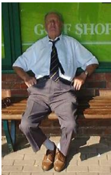
Our tireless President taking a keen interest in proceedings or perhaps he was dreaming of scoring 17 pts on the first nine?

With the Wayfairers financial year now coming to an end we have £109.58 in hand but some of this will be required to buy some more umbrellas 'substantial' raffle prizes for our next meeting!