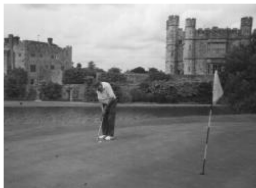
The President sends New Year Greetings from his country seat!