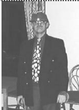
Every inch a Plonker, but not this time!

Our thanks go out to both these Guys who gave us such a tremendous day and evening!