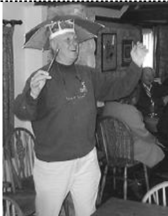
Singing in the Rain!

Our thanks go out to both these Guys who gave us such a tremendous day and evening!