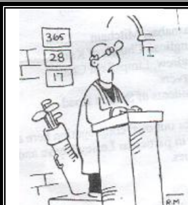
"Hymn No. 28 omitting verses 1,3,4,5..."

Currently 10 Wayfairers plus 3 guests ("or better halves") are booked for a early morning departure on Monday 28th May for a three night stay at Etretat, on the Normandy Coast. The plan is to play at Saint Saens en route to Etretat and on the return journey tackle one of the courses near Abbeville. The Etretat Golf Club is right next to the Hotel with spectacular views from the top of the cliffs. Here's 'bon voyage and good weather to all.