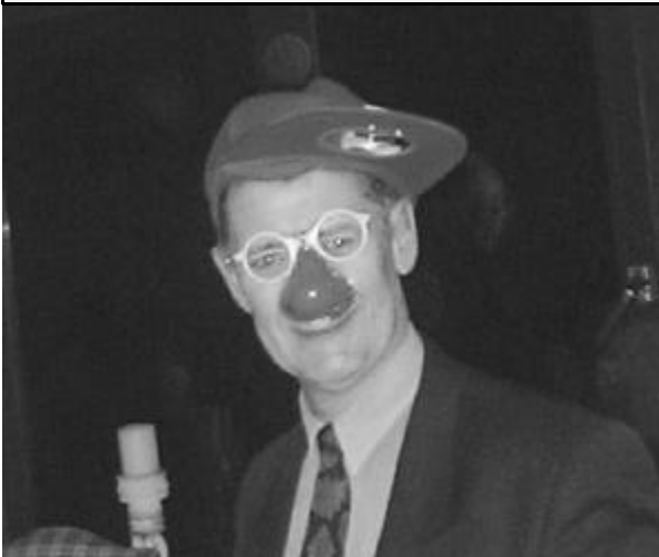
No need for a caption - Anyone for Farnham!?