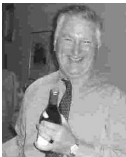
THE CLUB CHAMPIONSHIP*