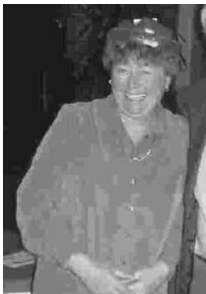
The Wayfairers first 'Lady Plonker'!

Stableford Competition, a Team Stableford Event and a lunchtime Putting Contest. You always get value for money with the Wayfairers!