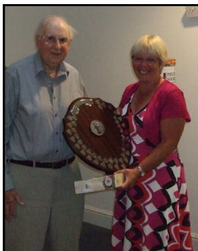
Winner of the Wayfairers Trophy