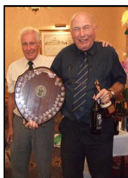
Winner of the Wayfairers Trophy and Spring Trophy In 1st Place