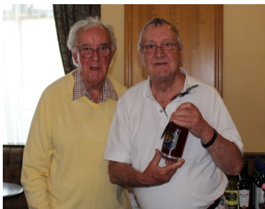
Overall Winner Guest