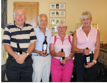
2nd Place Team Event