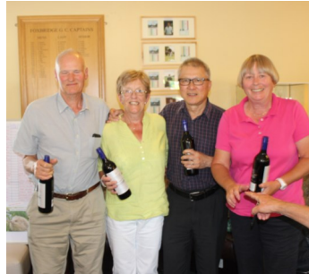
Winners of the Pink Ball Trophy