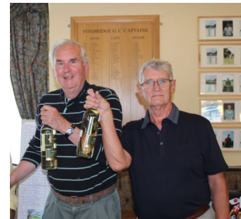
3rd & 4th Places