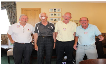
Hall Of Shame - They all lost the pink ball