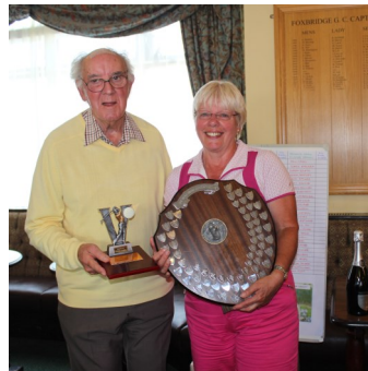
Winner of the Wayfairers Shield & Vardon Trophy