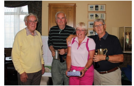
Winners of Nearest the Pin, Open LD & 19 & Over LD