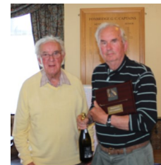
Winner of the Par 3 Challenge