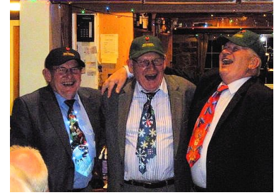
Last but not least the Wetherspoon's rejects!