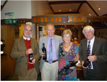
Scramble Team Competition Runners Up