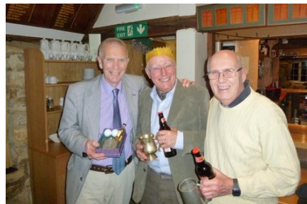
Winner of Open L.D. Over 19 LD & Nearest the Pin