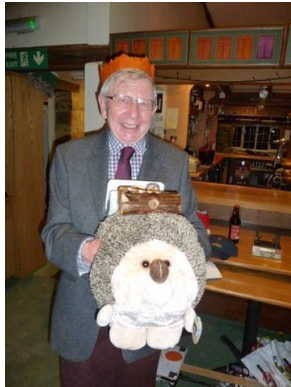
Winner of the HedgeHog & Shortest Drive.