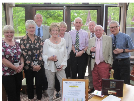
1st and 2nd Team Competition Winners Well done the Ladies Team who finished first.