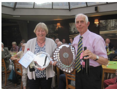
Winner Peer's Plate and Wayfairers Trophy