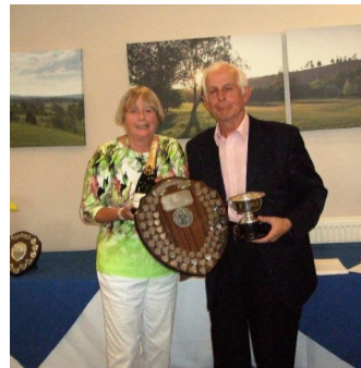
Winner of the Wayfairers Trophy & David Rose Bowl