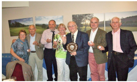
Winners of the President's Trophy the Secretary's Team Too many to name!