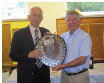
Winner of the Wayfairers Trophy and 50 Bob Set