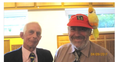
Winner of the Birdie Cap