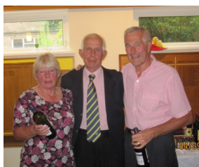
2nd & 3rd Places Overall