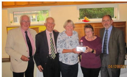
Pink Ball Team Winners