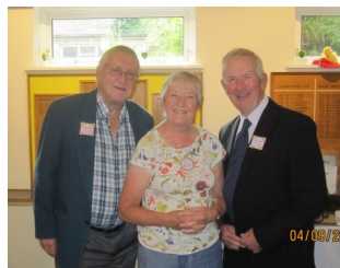
The Dreaded Hall of Shame They all lost the Pink Ball