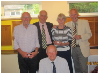
Pink Ball 2nd Place