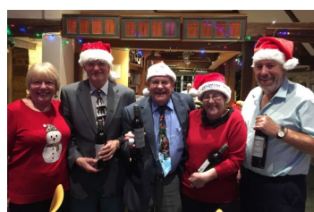
Scramble Team Competition Winners