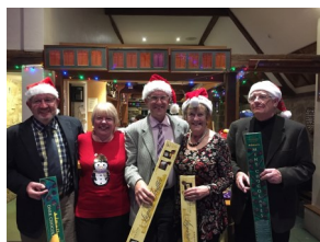
Scramble Team Competition Runners Up

PRIZES PRESENTED BY Birthday Girl Val