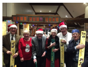
In 3rd Place