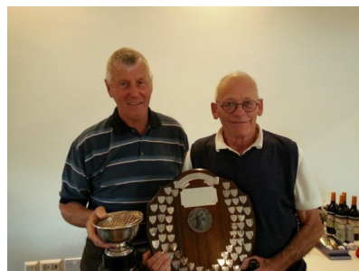
Winner of the Wayfairers Trophy & David Rose Bowl