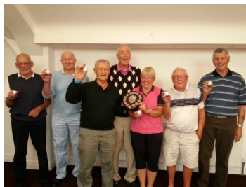
The winners of the President's Trophy were the Match Co-ordinator's Team Too many to name!