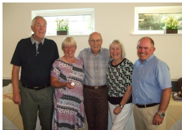
Pink Ball 2nd Place