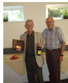
Winner of the Par 3 Challenge Plaque