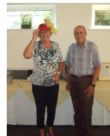
Winner of the Birdie Cap