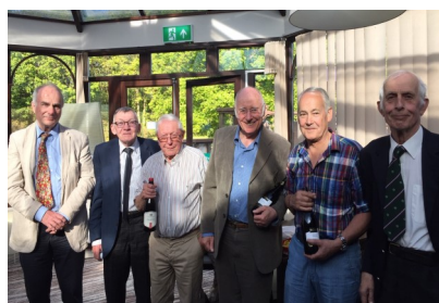
Other Individual Placings