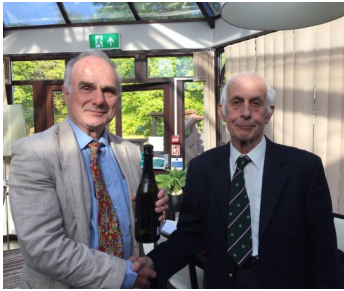
Par 3 Challenge Champion