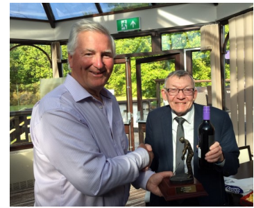
Winner of the Jeff Hogg Trophy