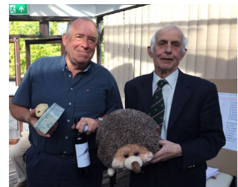
Winner of the Hedgehog Your friend and mine -