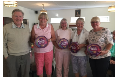
The 2nd Team