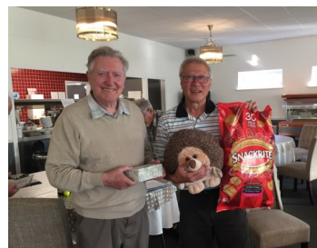
Happy Hedgehog Winner