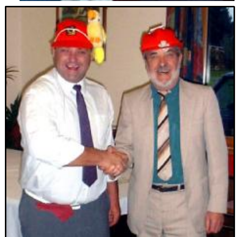
If you want to find a Rose - look under the caps. 1 Birdie & 1 Plonker.