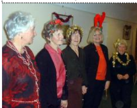
The line up for the Ladies Christmas Competition.