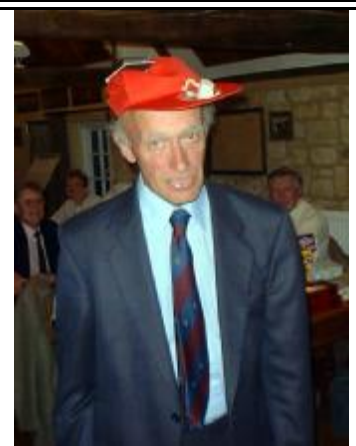
It's a shame - but somebody has to get it - and never so well deserved!