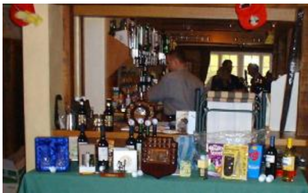
The Prize Table at Holtye