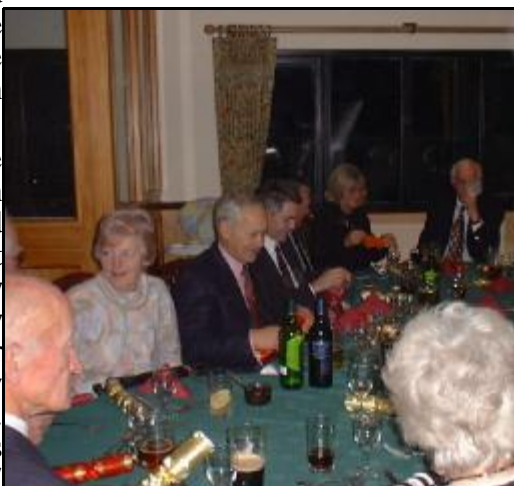
Getting into the Christmas Spirit

Despite a very indifferent meal and being crammed into tables in one corner of the bar/lounge, the Dunkirk spirit of the Wayfairers began to show,