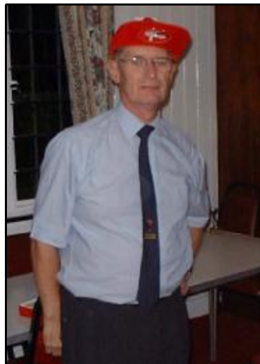
Above: Yet AGAIN one of our organisers gets the Plonker Cap - is nobody else doing any plonking around here??!