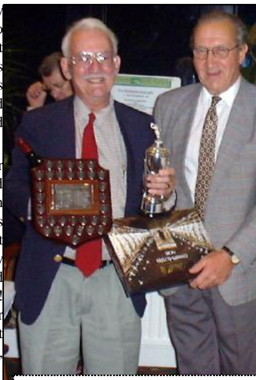
Honorary Life Member & Winner of the Wayfairers Trophy- all in 1 day!

While all this was going on, the first playing group were involved in a very different sort of tussle. Due to many of the matches in the Knock Out Competition being