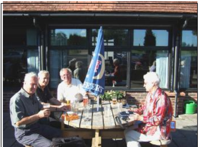
Just a reminder - this was Foxbridge June 2007

If you stay out of water you get to keep your £1! (What a bargain! Ed) ...and where do all these £1's go? A few to the Warrilow Worldwide Cruise Fund, but the majority will provide for incidental expenses at our special subsidised day in July. It will be money well spent! So keep your balls dry!