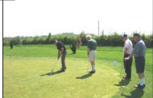
Weighing up the Putting