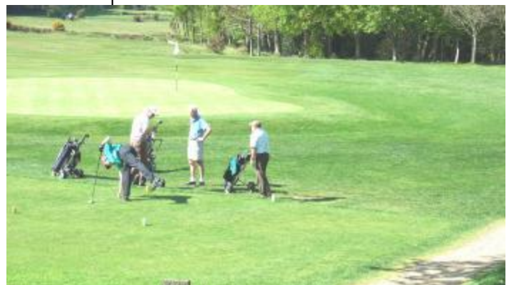
"Just another 9 holes and we can have a cold beer"!!