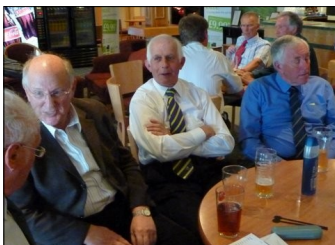
Whose round next?!