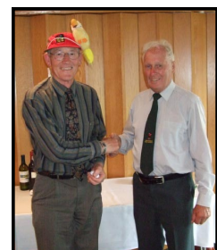
Winner of the Birdie Cap