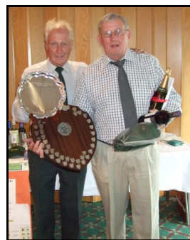
Winner of Peer's Plate and the Wayfairers Trophy