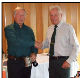
Winner of Nearest the Pin