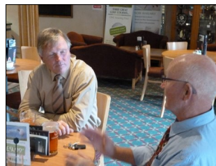
And on the 3rd green I missed this tiny putt!