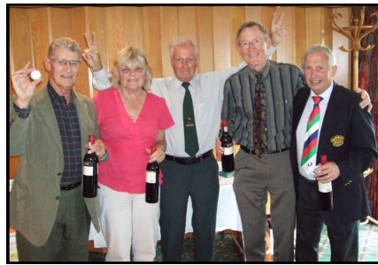
Team Competition Winners