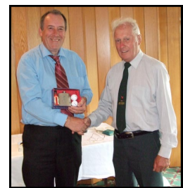
Winner of the Open Longest Drive