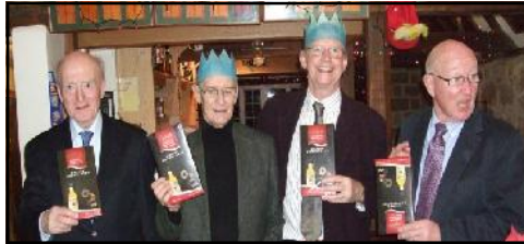
Scramble Team Competition Runners Up