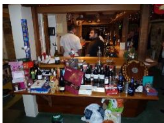
The Christmas Prize Table