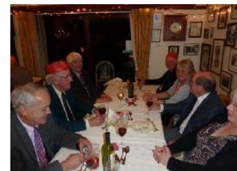
Happy Christmas to all our readers