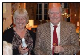
The Happy Couple Happy Birthdays to you!