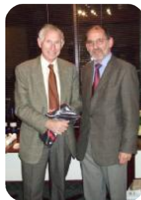
Our Website Master picks up 4th Prize