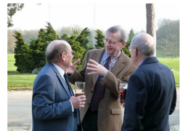
"If you scored more than I did I'll throttle you!"