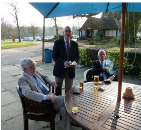
Spring Sunshine with a welcome drink on the patio at Gatton Manor.

Friday 15th April Casual Day at Horne Park Monday 16th May Peer's Plate at Hoebridge Tuesday 21st June Two Ronnies Pairs at Foxbridge Monday 25th July Charity Day at Ifield Friday 19th August Casual Day at Villa (TBC) Friday 2nd September Pink Ball Day at Hassocks Friday 21st October AGM Autumn Cup at Clandon