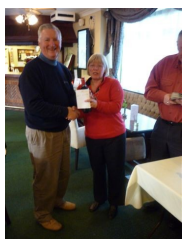
Nearest the Pin and Birdie Boy!