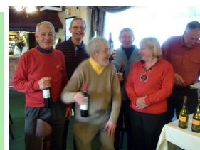
The Triumphant Winning Team

Other prizes were handed out right down from 4th to 20th place but no room for more photos!