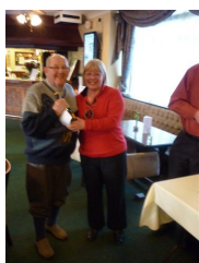
Nearest the Pin in two on the 18th