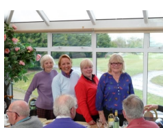
Our four valiant and viva- cious Lady Captains! Always open to bribes!